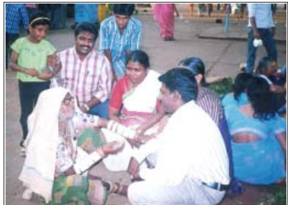
The visiting Team with Gowli people

On the 24th morning we saw the first church built for Siddhi people, thirty years ago at Kuchugaon. We learnt that one of the political leaders here was a person who had attended our